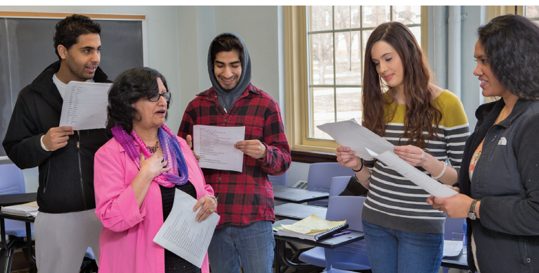
You will interact with your professors and other students during our discussion-based classes.

"And every student has a departmental adviser, a faculty member who teaches in the student's program. We help our students develop their abilities."