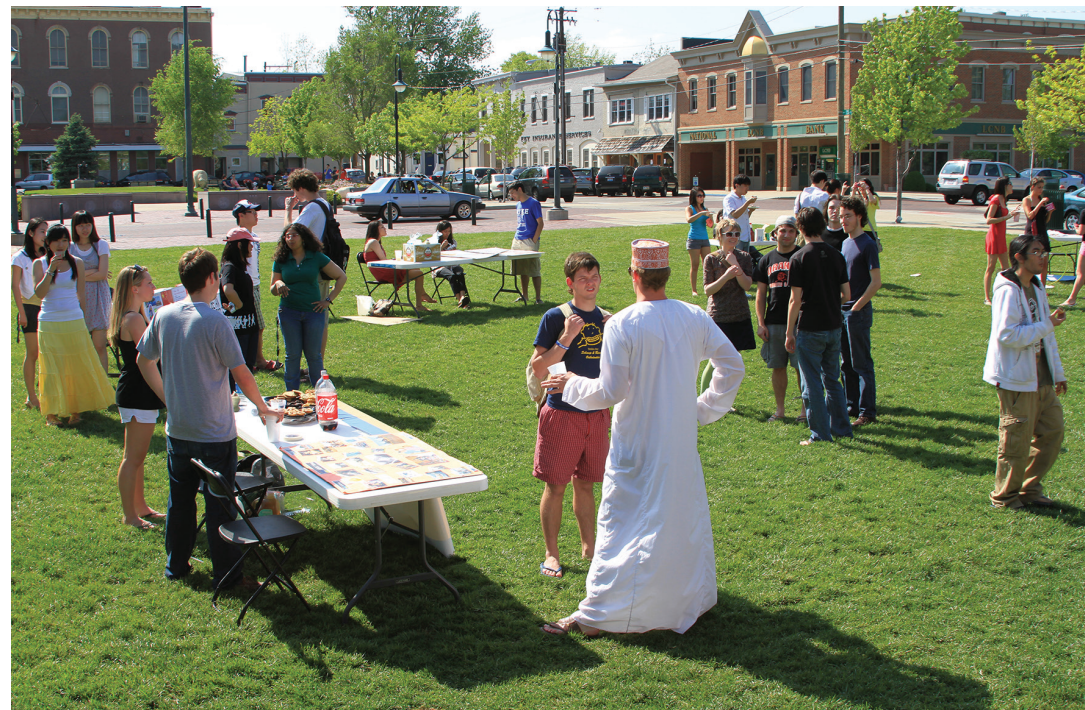
Uptown Oxford, right next to campus, has restaurants, shops, and a park where you can enjoy concerts and other activities.