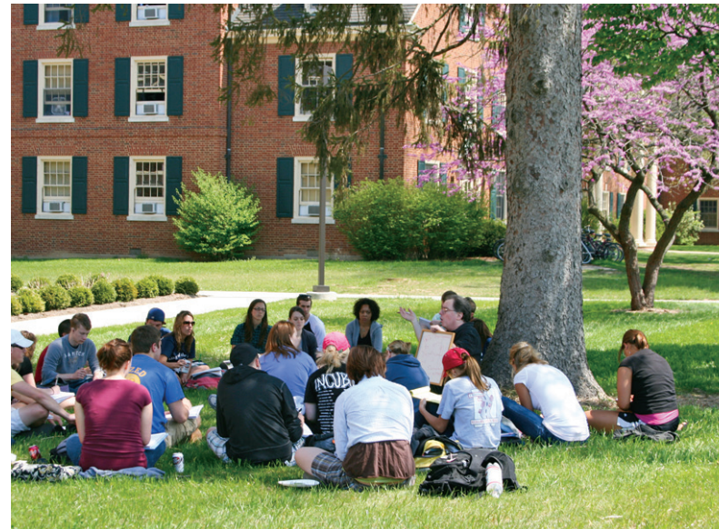
Our most experienced and distinguished faculty teach introductory as well as advanced classes.

Find out more at MiamiOH.edu/ap-ib-credit .